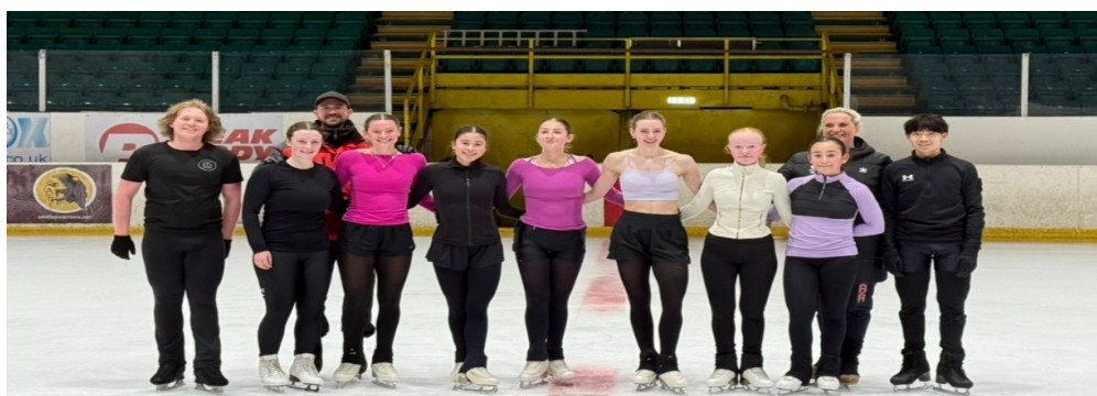
May 2025 Mini Camp